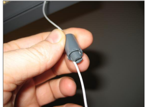
Insert locking screw into the "housing", and tighten slightly with a screwdriver