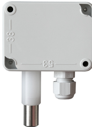
Fig. 2 Rear view with dimensioning of openings for mounting