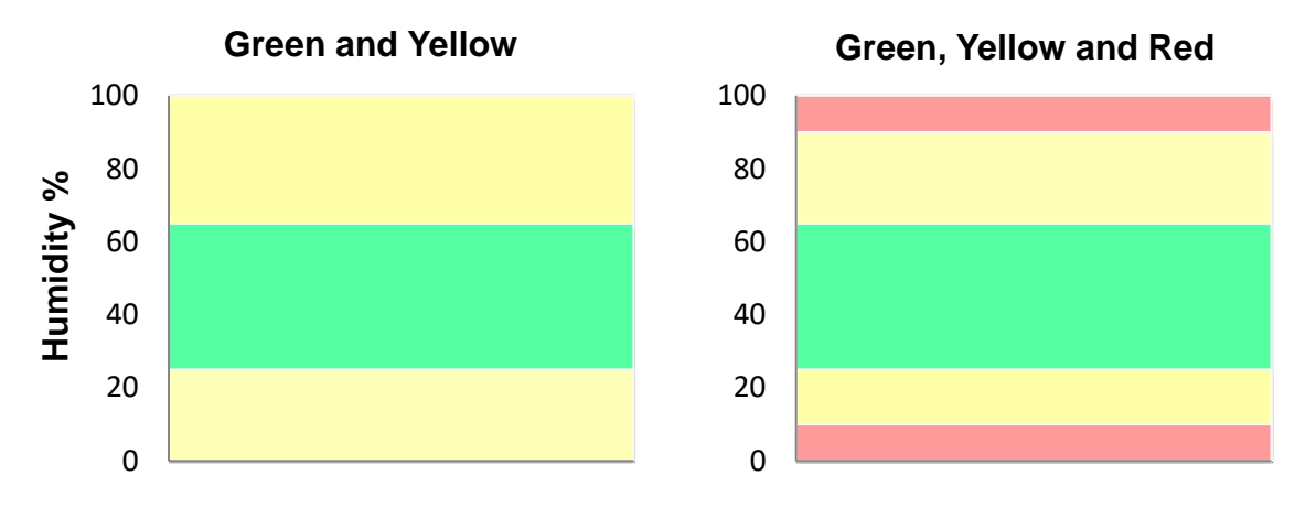
Figure 5. Default colors of Notification LED.

It is possible to modify by parameter the humitidy thresholds of the range corresponding to each colour. The following figure shows an example with the default threshold values: